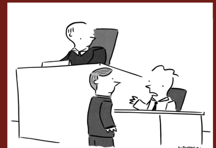
“I wouldn't call it identity theft, I just self-identify as other people.”